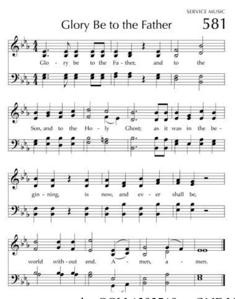
Songs reprinted with permission under CCLI 1292718 or ONE LICENSE A-731346.