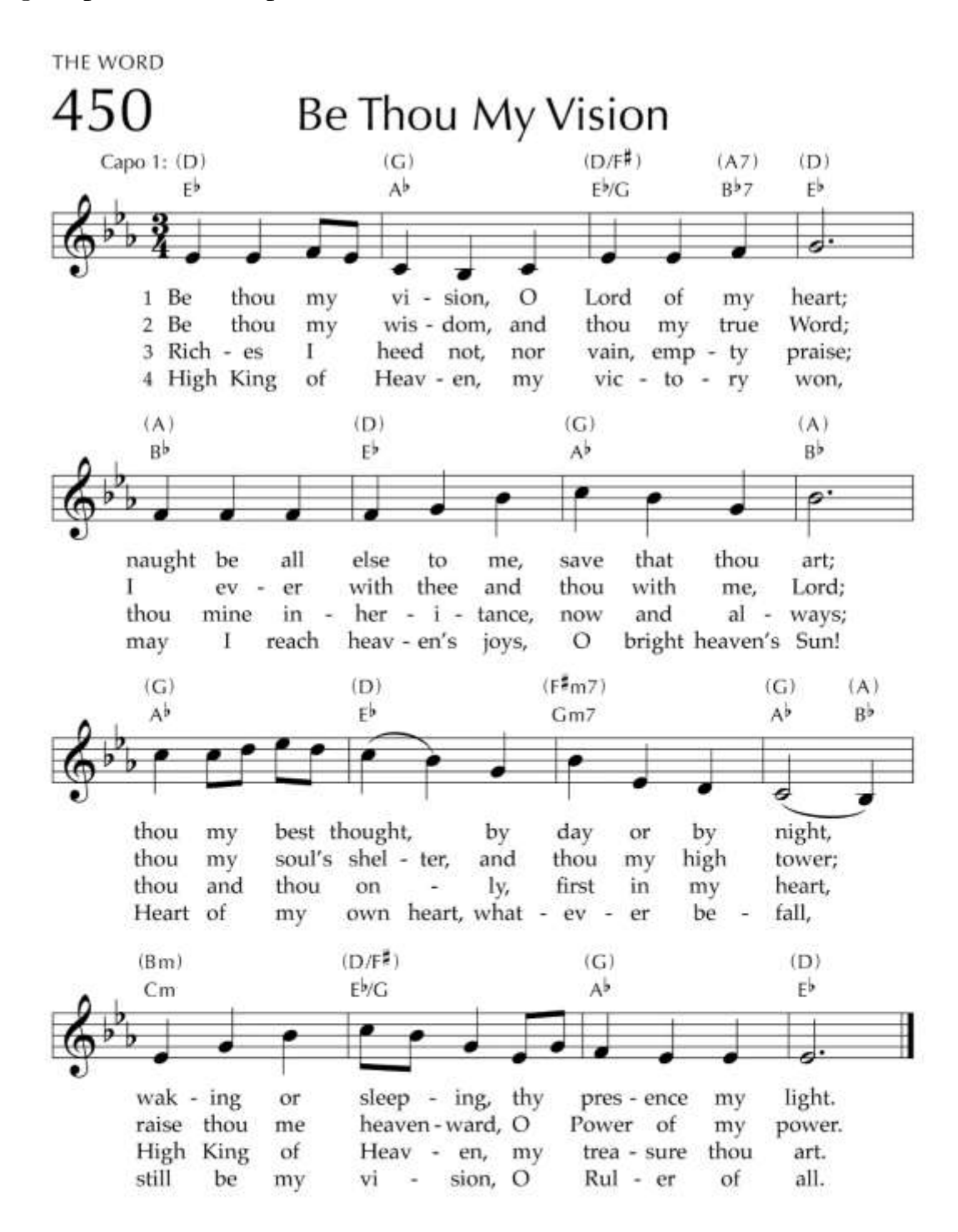
Guitar chords do not correspond with keyboard harmony.

Songs reprinted with permission under CCLI 1292718 or ONE LICENSE A-731346.