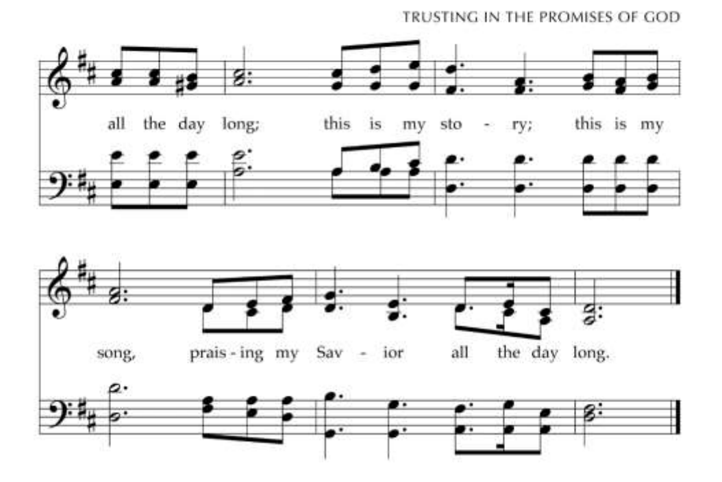
Songs reprinted with permission under CCLI 1292718 or ONE LICENSE A-731346.